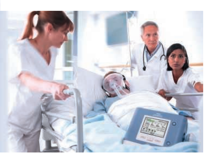
Intuitive menu for quick changes