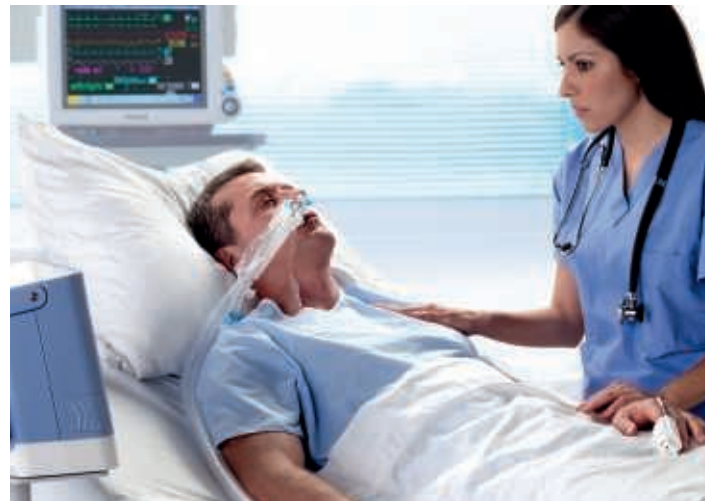
Passive circuit allows a simpler setup